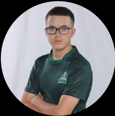
SATURDAY 1ST Dubs Wood